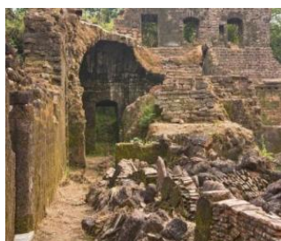
BIBLIA, VOLUME 5